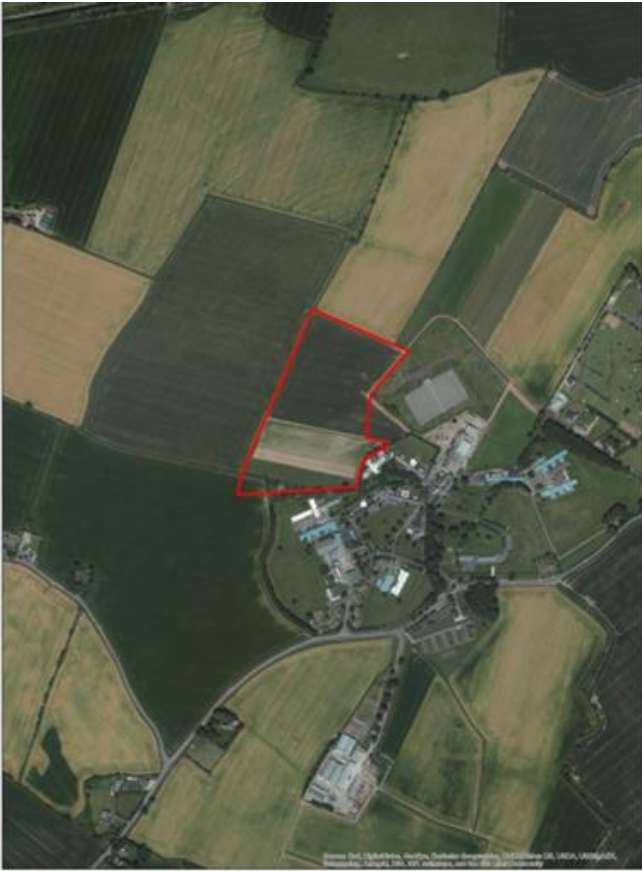
Figure 1.2 Termination Point Reservoir Site (Peamount, south Dublin)