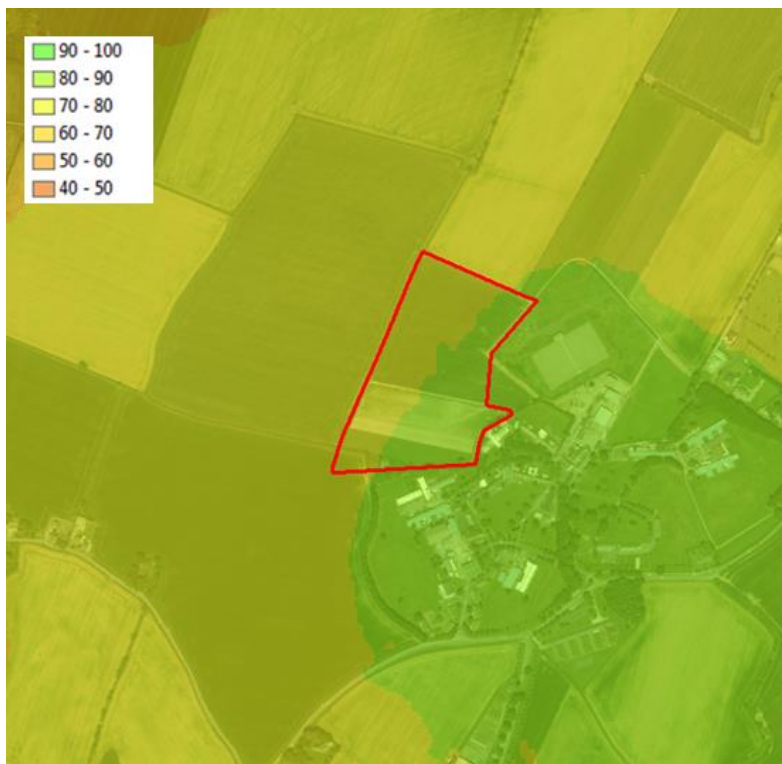
Figure 2.1 –TPR Site Elevation Map

The ground, where the TPR is proposed to be sited, is gently sloping from east to west (see Figure 2.1); and could be readily integrated into its environs similarly to the existing facility.