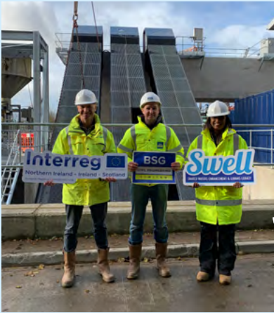
NIW, BSG and McAdam staff pictured in front of the new screw pumps which weigh 24T each (November 2019)

BSG, who carried out extensive upgrades to Strabane Wastewater Treatment Works, including the installation of three enormous screw pumps – the longest ever manufactured by the supplier – was one of only three companies to make it to the final of the Transport & Utilities category in this year's Construction Excellence Awards.