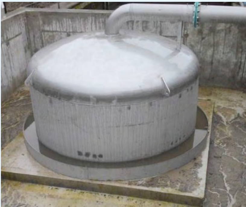
The Eliquo Hydrok CWF Storm Flush® system

To improve treatment processes Irish Water is utilising innovative technology in the form of a storm flush system on the Lifford and Killea projects.