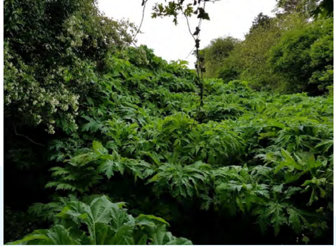
Giant Hogweed at Lifford site