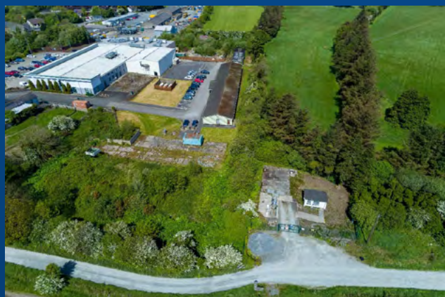
Existing Lifford WwTP

The site for the new Lifford WwTP is compact at 2000m 2 , presenting a challenging location to build the sizable new plant that is being constructed. Major excavation works were required to reduce site levels down to allow for construction of the WwTP, with 4000m 3 of earth excavated (equivalent to 450 lorry loads of material). Significant progress has been made at the Lifford site in a short space of time. All primary settlement tanks, Rotating Biological Contactor (RBC) treatment units and final settlement tanks are now installed. The storm tank has also been completed. Foundations for the new inlet works and the new control building are now constructed while improvements to the sewerage network in Lifford have got underway.