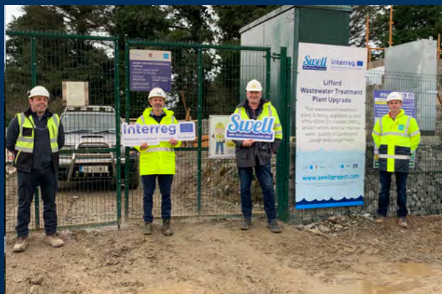
Lifford site team