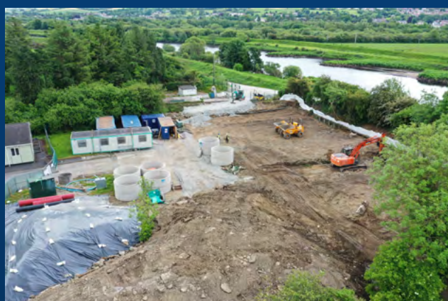
Early site works