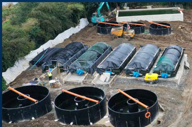
Installation of RBCs