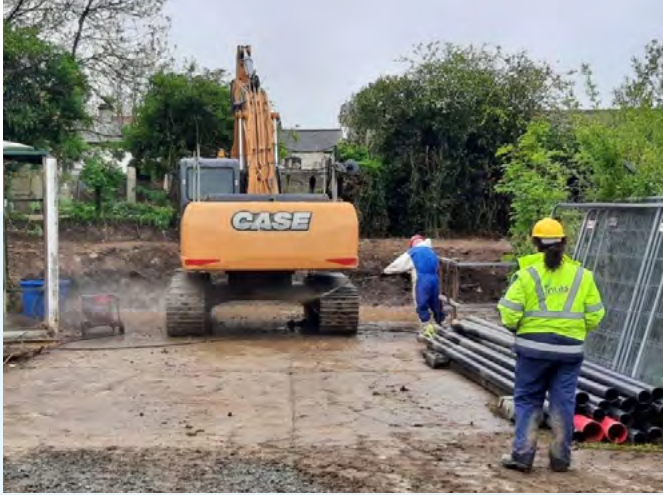
Invasive species biosecurity measures at the Lifford site

Irish Water appointed an Invasive Species Specialist to oversee the safe clearance of the Giant Hogweed plants from the site before construction works commenced.