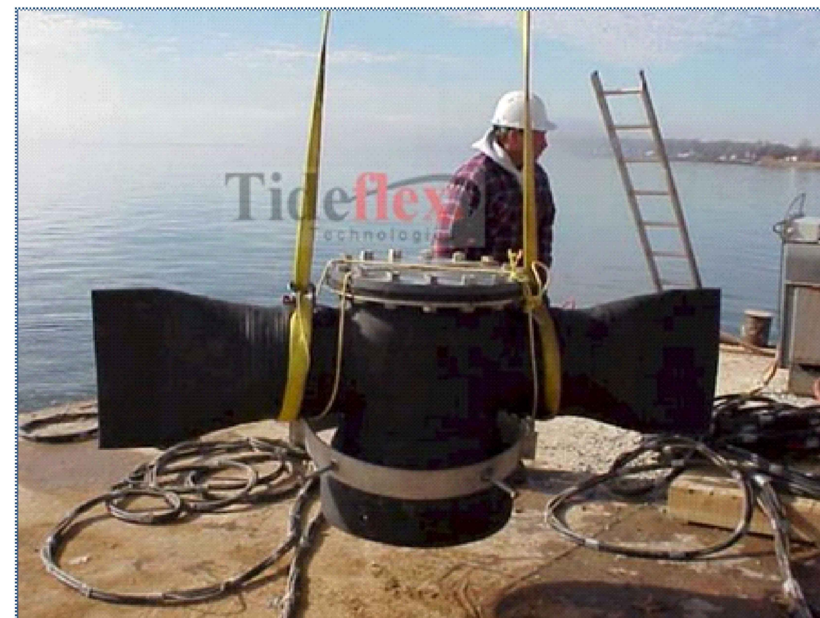
TYPICAL DIFFUSER VALVE