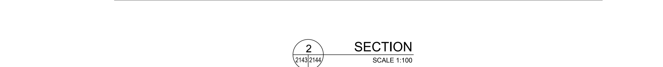
2 SECTION SCALE 1:100