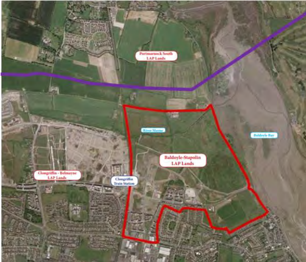
Figure A6.4 Baldoye-Stapolin Local Area Plan (LAP), 2013