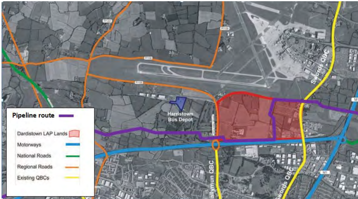
Figure A6.2 Dardistown LAP lands with orbital pipeline route indicated in purple