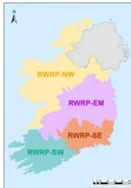
Figure 1.2 Regional Areas of the NWRP

The four regions are shown in Figure 1.2. The regional boundaries are only relevant for the development of the first NWRP and have been identified as the most appropriate way to allow Uisce Éireann to identify Preferred Approaches (water supply solutions) in an efficient and timely manner. Once the first NWRP has been finalised, while it is comprised of the Framework Plan and four Regional Water Resources Plans, together they will be treated as a unified Plan. The relevant regional groupings will have no ongoing application. Where Local Authority areas have been split, Uisce Éireann will engage with the relevant Local Authorities following the finalisation of the RWRPs, on the outcomes for all water supplies in their areas.