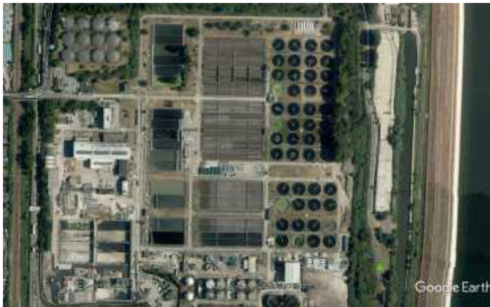
Figure 1- aerial view of Deephams STW before IFAS and Mecana

Deephams comprises of three treatment streams (A,B,C), each with rectangular PSTs, a (nominal) 100m x 100m x 3.5m ASP divided into 4 lanes each, and 16 FSTs per stream. A and B streams are highly plug flow, 4-pass lanes, whereas C stream is single pass with approximately 4:1 L:W ratio.