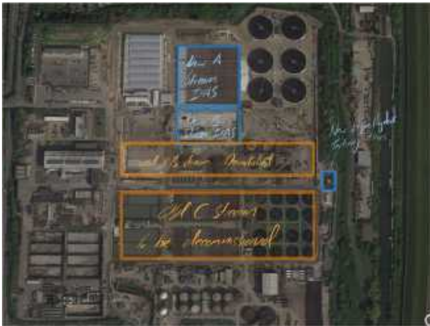
Figure 4 Aerial view showing core scheme features

Beyond providing the temporary process enhancement to facilitate the demolition and rebuild of the principle process units at Deephams, the IFAS system has been designed in close collaboration between Eliquo Hydrok and Aecom Murphy Kier, such that the IFAS cages are able to be transplanted from the old 3.5m deep B and C stream ASPs into the new 7m deep A stream, and latterly ½ B stream ASPs.