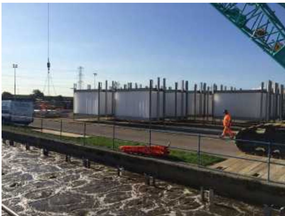
Figure 3 modular cages being assembled and installed

The Eliquo Hydrok IFAS system was manufactured off-site and delivered for rapid build and installation into live aeration lanes to minimise both site working and process disruption. The textile media is supported with stainless steel cages, and as such needs no baffles or sieves to retain its position within the ASP, and hence no additional requirements of the inlet works, nor of the hydraulic profile through the plant.