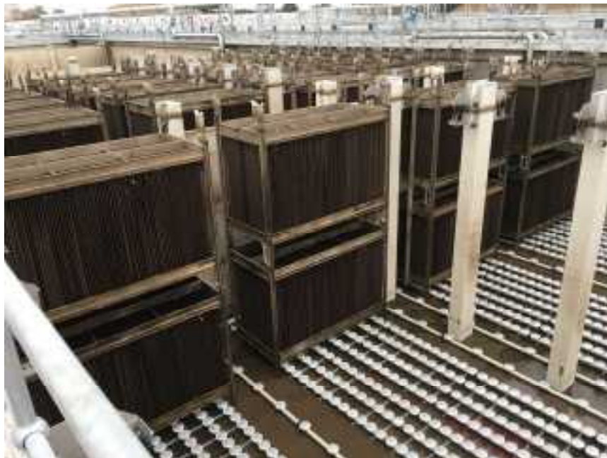
Figure 5 New A Stream 7m deep ASP, complete with transplanted cages from the old B Stream