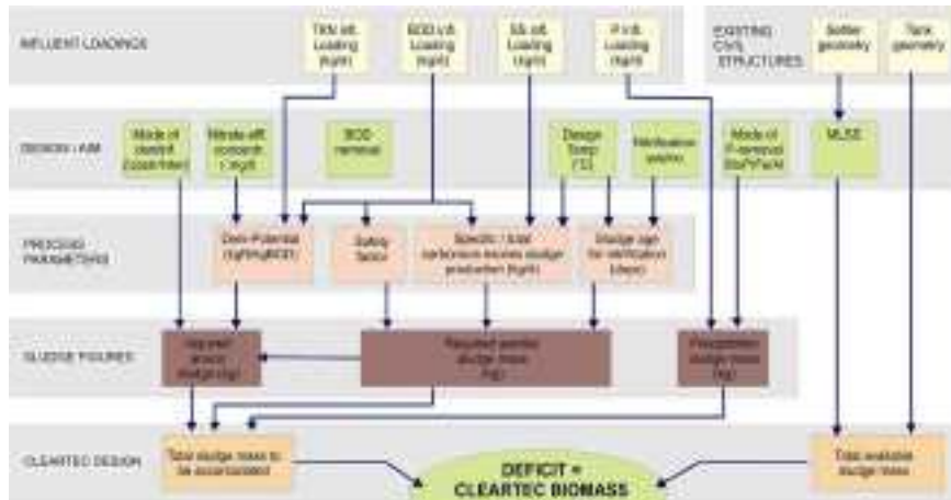
Figure 2 IFAS calculation approach

The Eliquo Hydrok IFAS system is a pure integration of suspended and sessile biology, with the textile media enabling the ASP to perform as if it were operated at much higher MLSS, but without requiring additional settlement capacity from the FST's.