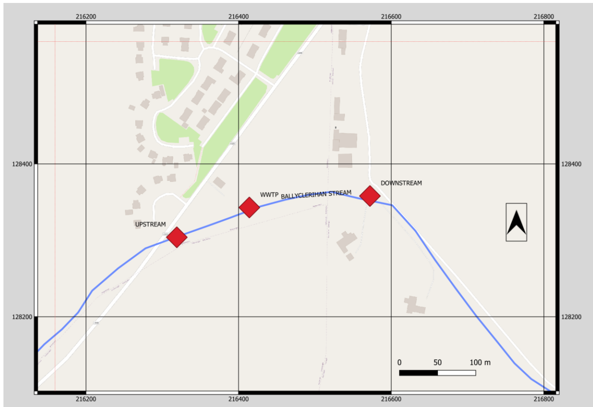
Table 2. Location of sites sampled upstream and downstream of Clerihan WWTP on 6 December 2023.