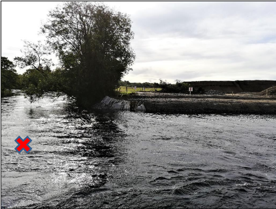
Plate 2: Construction works on opposite bank – channel reprofiling, geotextile bank revetment, construction related spoil upstream of discharge point - X marks approximate position of usual sampling location.