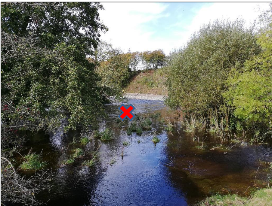
Plate 2: Excessively high river levels as a result of river diversion works and pulsed release of water from Pollaphuca Reservoir upstream (8am and 6pm each day) - X marks approximate position of usual sampling location. At this point the river was extremely swift and would be about 2m depth, or more.