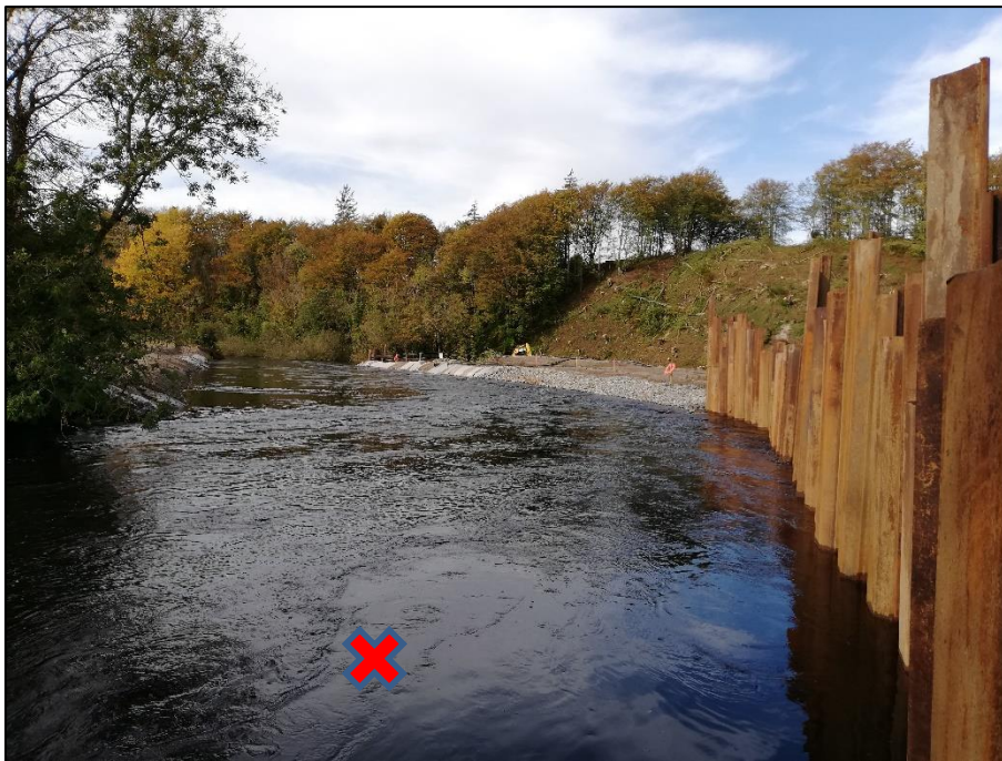
Plate 1: Significant instream construction works at the downstream SSRS site: sheet piling, channel reconstruction/diversion - X marks approximate position of usual sampling location.