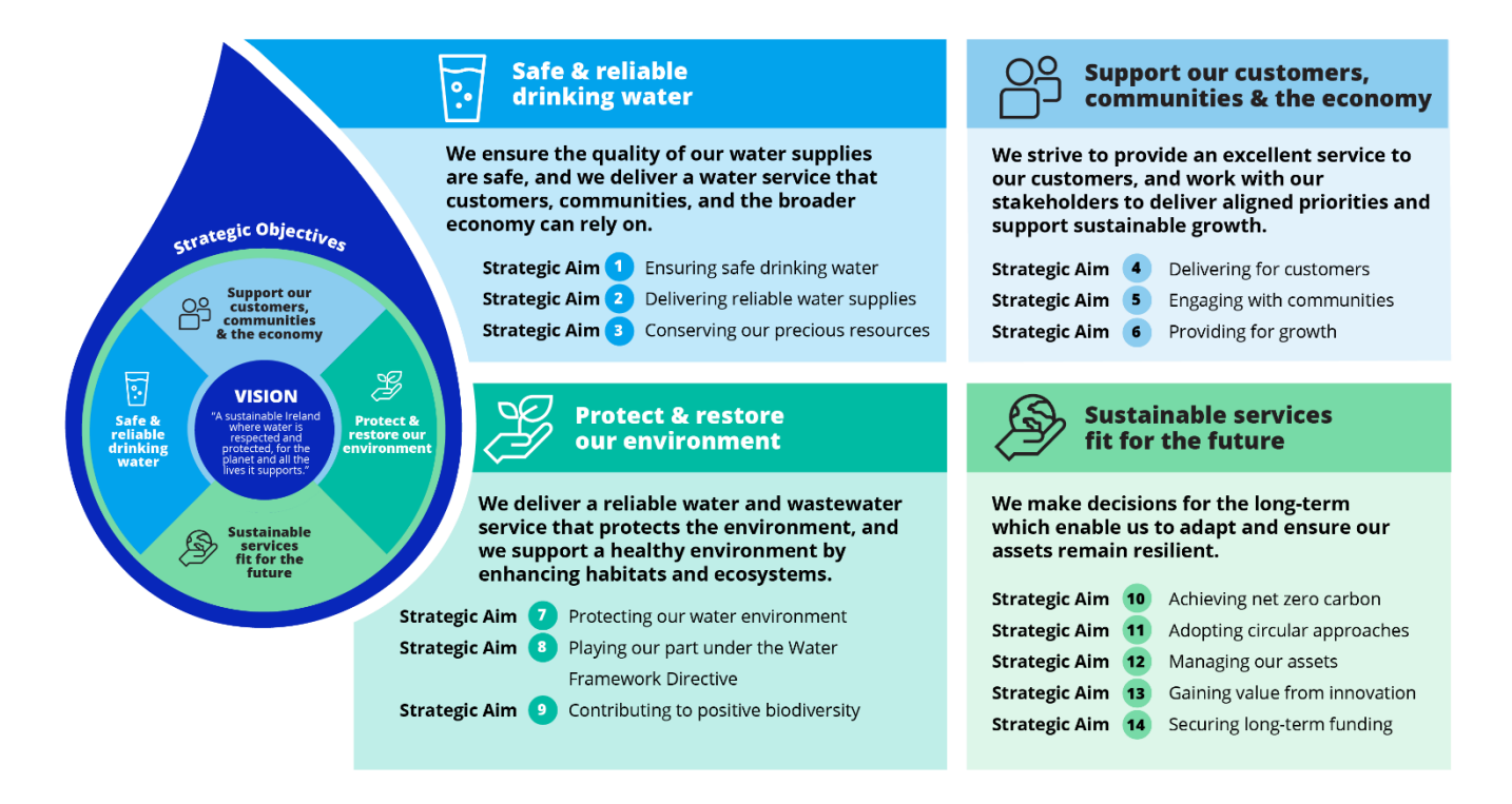
Figure NTS 6.1 WSSP 2050 strategic objectives and associated aims

supporting actions required to achieve these. Figure NTS 6.1 presents the WSSP 2050 strategic objectives and aims. The 35 actions are included in the SEA Environmental Report.