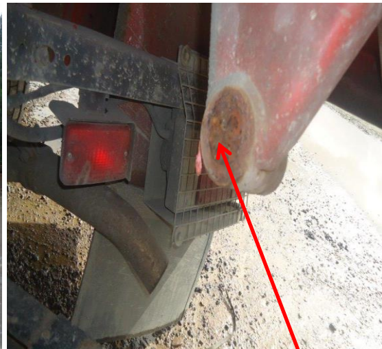
Sheared end of pivot bar seized within bracket