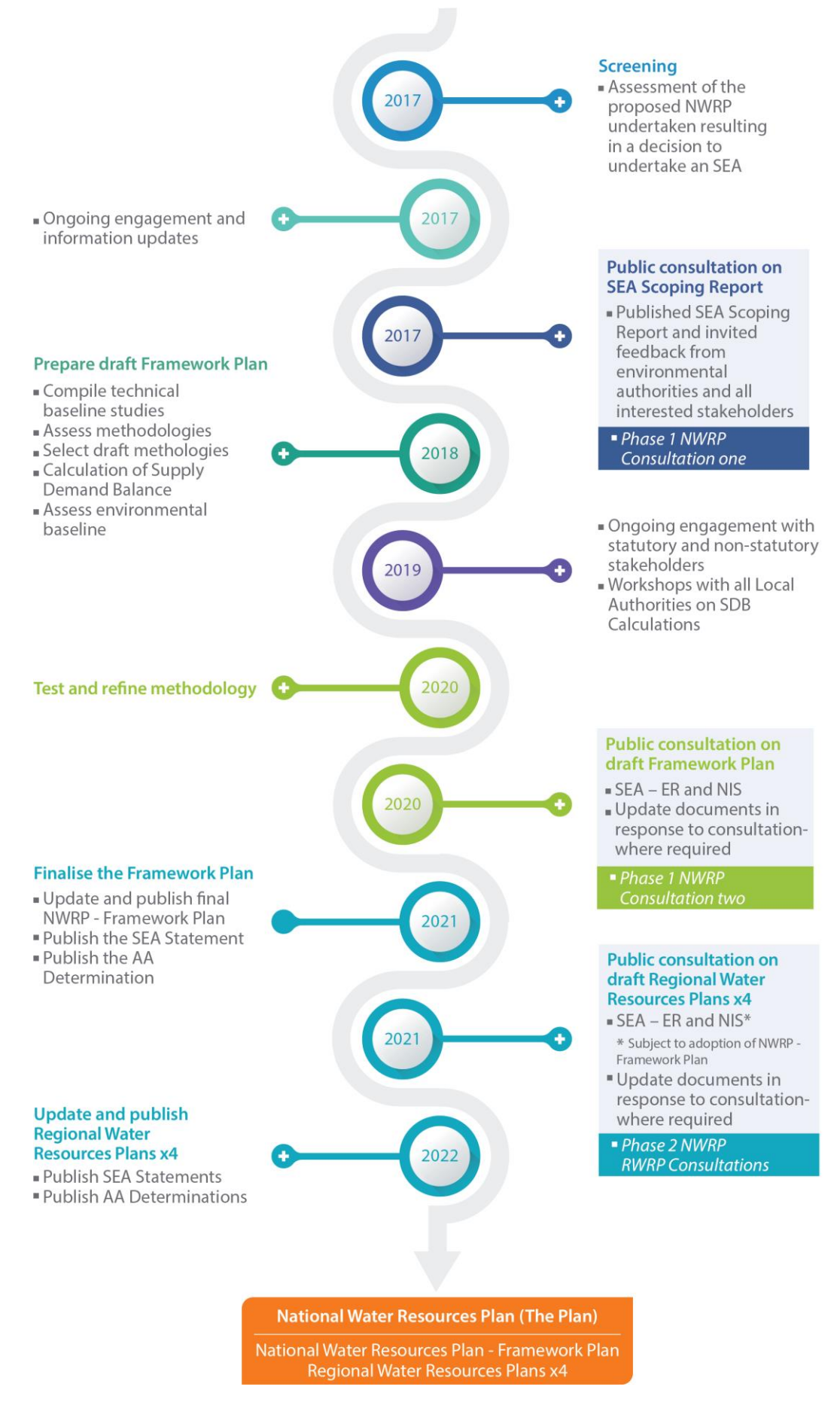
Figure 1.1 NWRP Consultation Roadmap